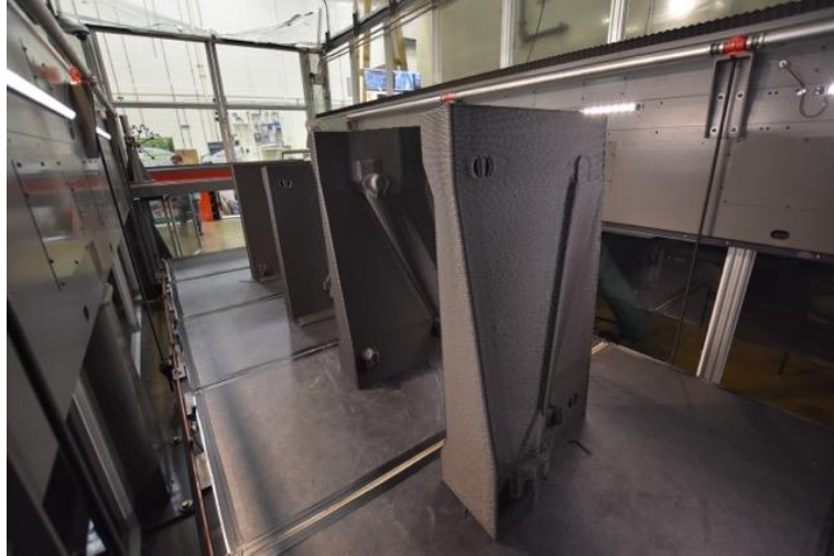
Fig. 2. Printed hydrofoil and spoke patterns, cope and drag.

Both spoke patterns are shown in Fig. 3 and the hydrofoil drag pattern in Fig. 4. Both figures show the patterns as printed. Machining of the patterns was performed on a Thermwood Multipurpose 5-Axis CNC Router.