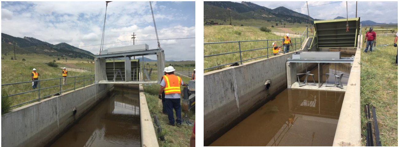
Fig. 8. First set of casted parts being installed in the Denver pilot.

Successful, modular approaches to rapidly deployable hydrokinetic power units will represent a strategy for cost effective renewable energy generation, leading to commercialization of a new distributed energy resource. The prototype components constructed in this Technical Collaboration will be pilot tested in 2017, and in fact the parts produced during Phase 1 have already been installed in the Denver Pilot. If successful, this Technical Collaboration will increase the Technology Readiness Level (TRL), onboard new customers and grow the production of continuous, reliable renewable energy in the United States.