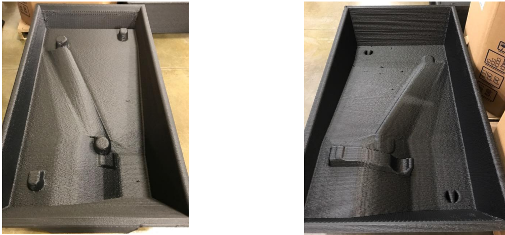
Fig. 1. Integrated pattern and pattern box, cope and drag.

From the Eck models, ORNL designed an integrated pattern and pattern box that was printed out of ABS with 20% carbon fiber on ORNL's BAAM (Big Area Additive Manufacturing) printer. The box and pattern design included material added to support overhangs. The extra material as well as the pattern surface and the inside edges of the patter box were to be machined to yield a smooth surface for the casting. Both the cope and drag pattern boxes (Fig. 1) were printed and weighed in excess of 500 lbs each. The design of the integrated box and pattern did not allow for sufficient access for the machine head of the router. Machining was aborted and it was decided, due in part to schedule constraints, to print the patterns without the integrated box. All four patterns, cope and drag for both the hydrofoil and spokes, were printed simultaneously in a single build. The four patterns are shown in Fig. 2 while still on the printer.