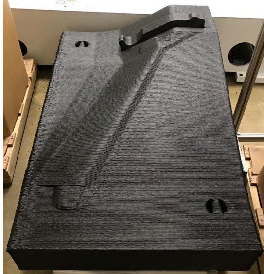
Fig. 4. Hydrofoil drag pattern, prior to machining.

The printed patterns were shipped to Eck Industries. Eck smoothed out minor defects with an automotive body putty, coated it with a heavy fill automotive primer and coated with an automotive lacquer. Patterns for the hydrofoil are shown in Fig. 5. After preparing the surface, plywood was used to form the pattern boxes around the pattern.