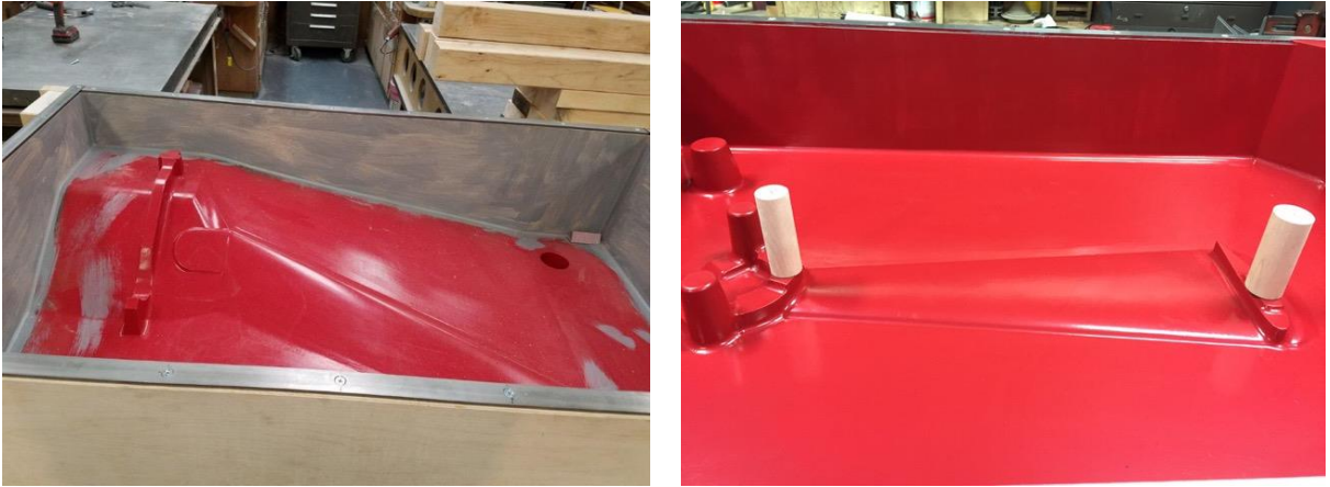
Fig. 6. Hydrofoil and spoke pattern and pattern boxes.

The pattern boxes were used to make castings for the Denver Water demonstration. Shown in Fig. 7 are a single hydrofoil and multiple spokes. The hydrofoil still has flashing on it and has not been cleaned up. The spokes are shown as they came out of the sand casting process prior to removal of the casting artifacts.