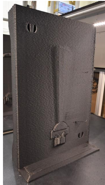
Fig. 3. Printed spoke patterns, cope and drag.