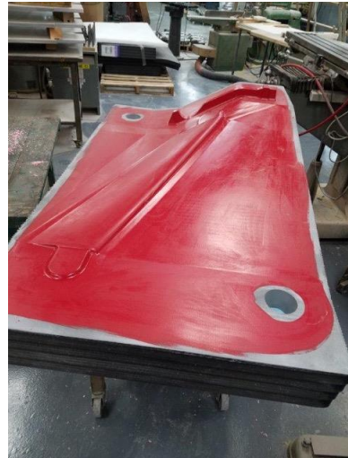
Fig. 5. Hydrofoil cope and drag patterns prepared at the pattern shop.